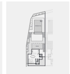
Land plot plan