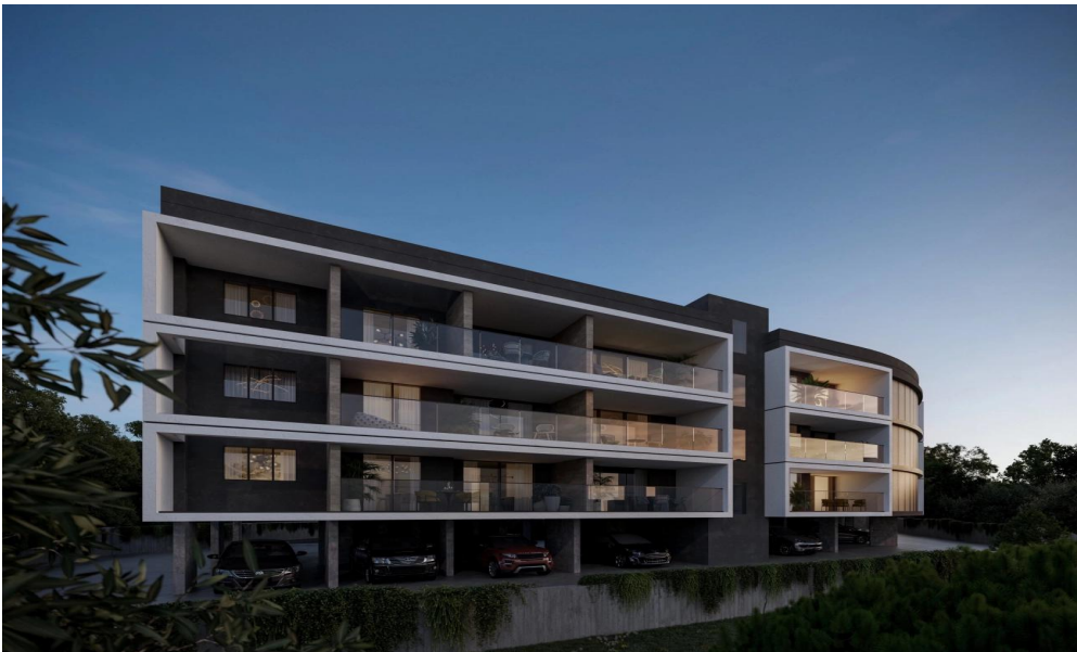
Ground floor Block A and B