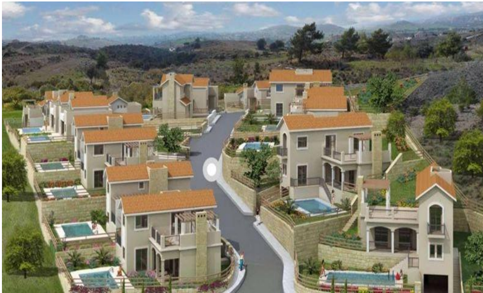
STYLISH COUNTRY RESIDENCES