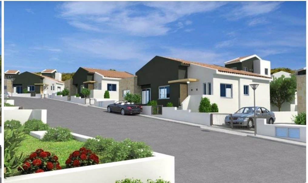
VILLA TYPE D1