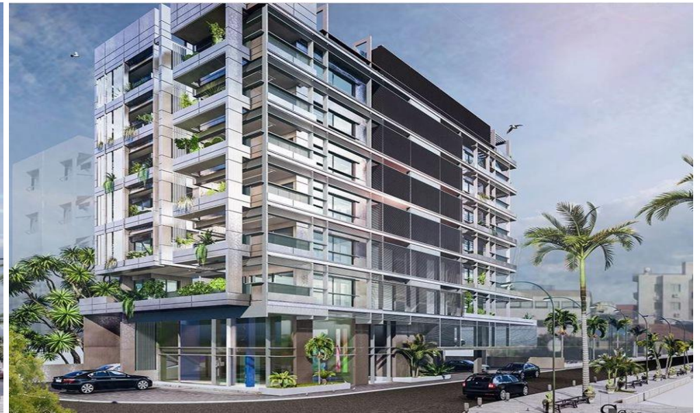
The Bachelor Flat - One Bedroom flat