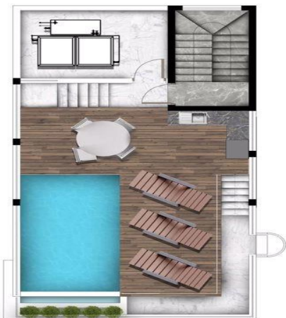
Villa 2, 4, 6 & 8