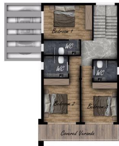
Villa 2, 4, 6 & 8