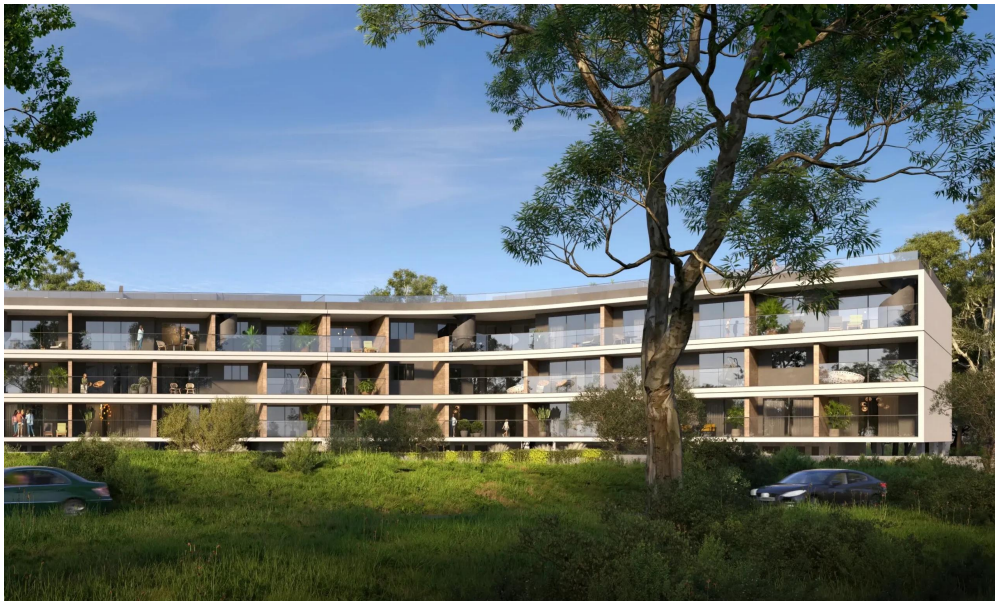
2nd floor Block E