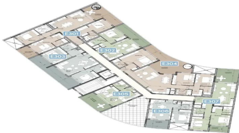
3rd floor Block E