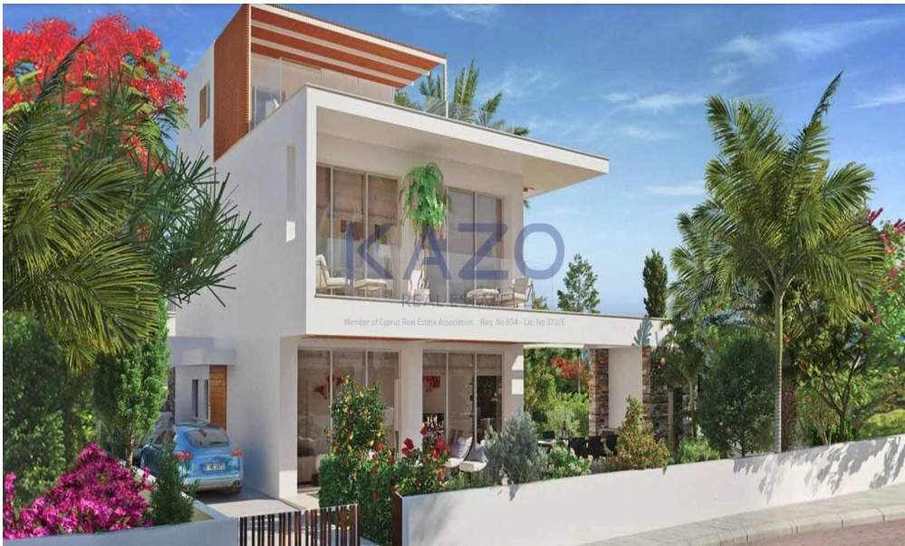
4 BEDROOM VILLA