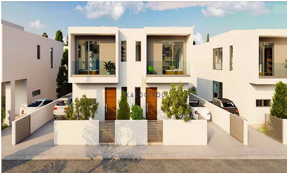
TYPE: A / 3 BEDROOMS