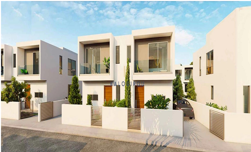
TYPE: C / 3 BEDROOMS