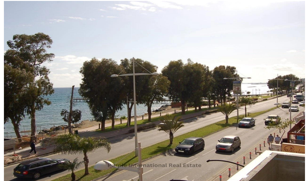
Purple International Real Estate