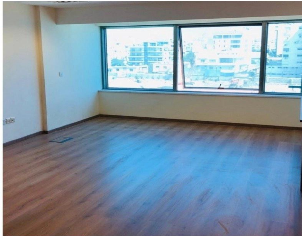
Purple International Real Estate