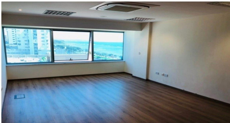
Purple International Real Estate