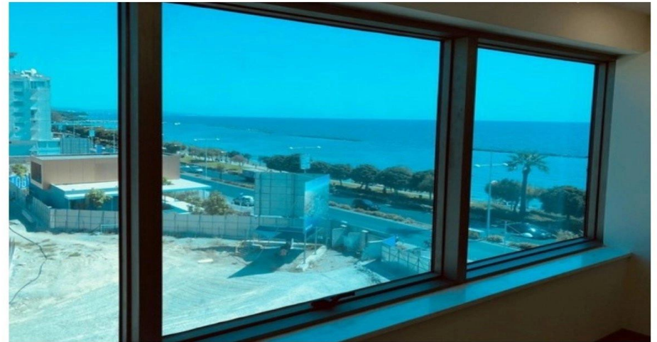
Purple International Real Estate