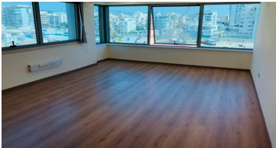
Purple International Real Estate