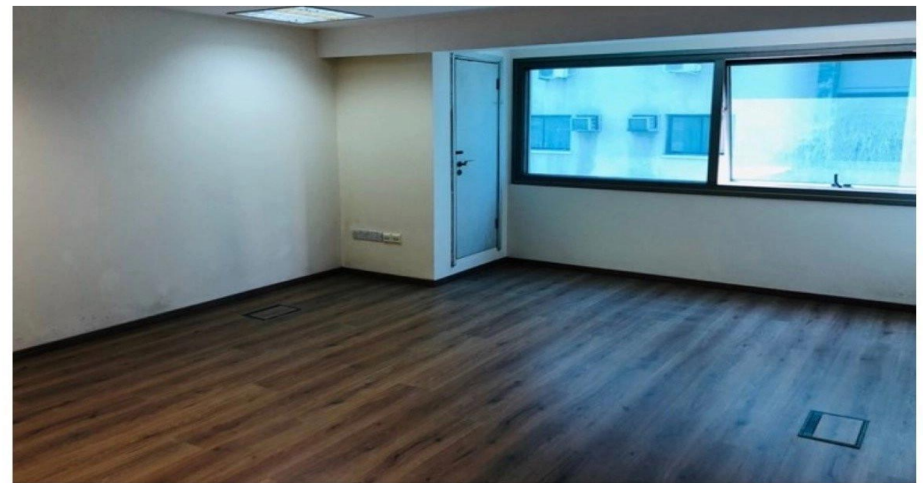
Purple International Real Estate