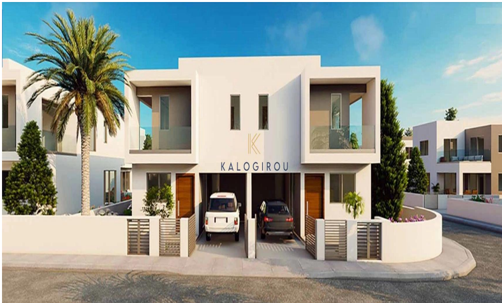
TYPE: NEREID / 3 BEDROOMS