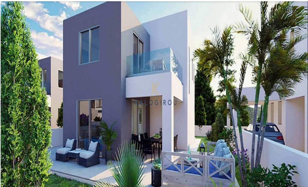
TYPE: GERANIUM / 3 BEDROOMS