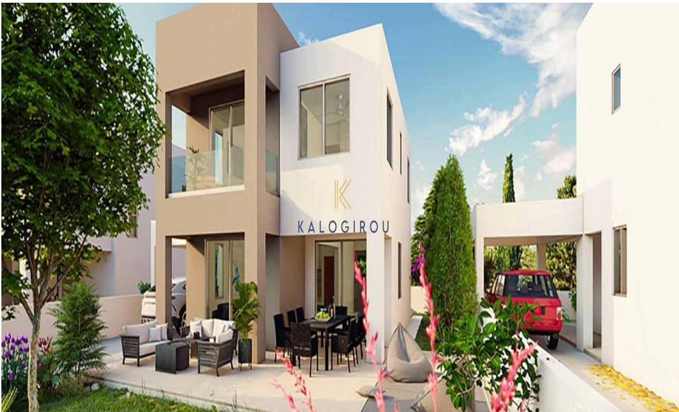
TYPE: ORPHEUS / 3 BEDROOMS