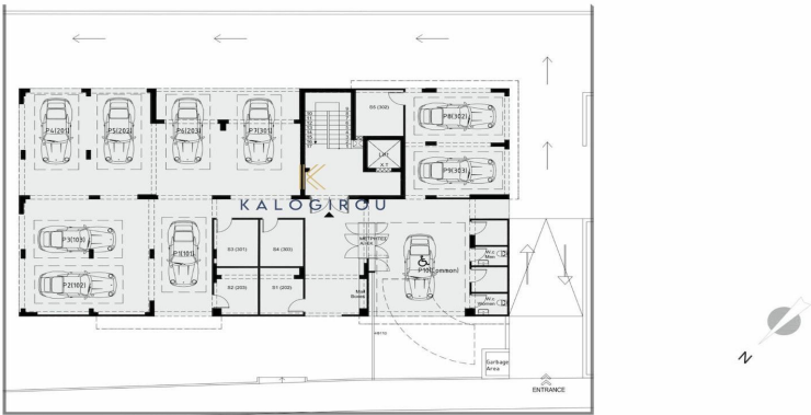
BLOCK A GROUND FLOOR