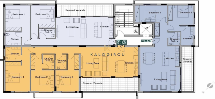
BLOCK A SECOND FLOOR