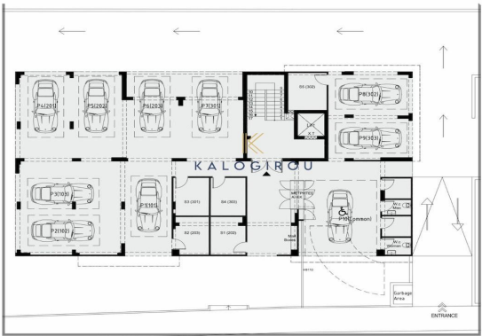
BLOCK A GROUND FLOOR