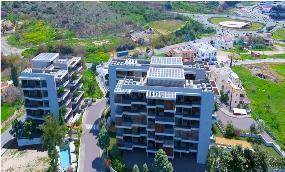
2 AND 3 BEDROOM APARTMENTS