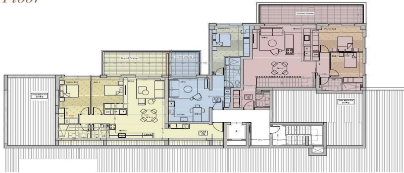
Levanda 1st Floor