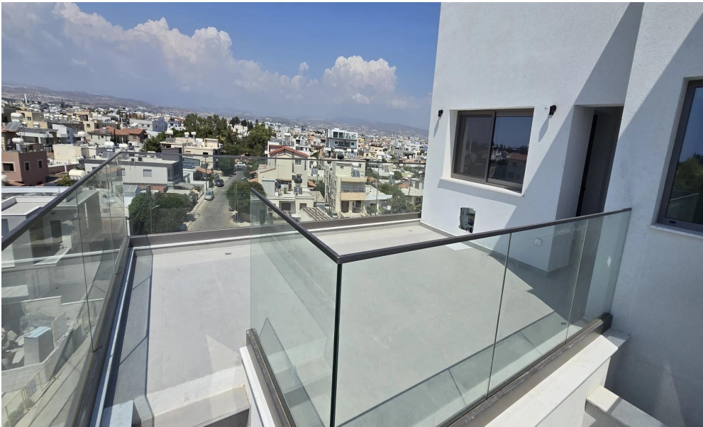
R OOF FLOOR