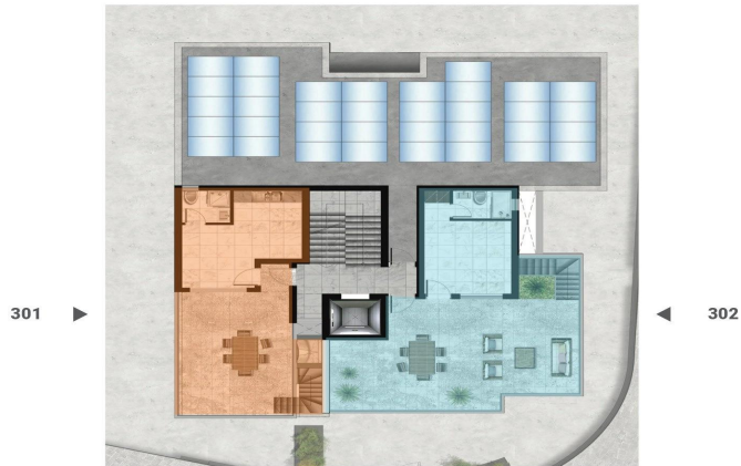
R OO F FLOOR