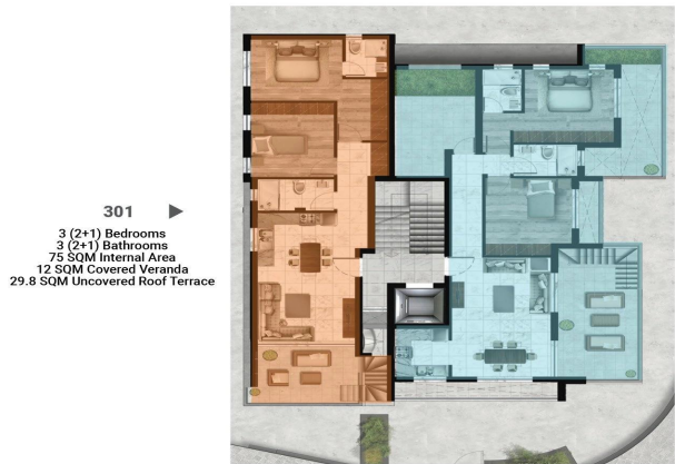
301 ▶ 3 (2+1) Bedrooms 3 (2+1) Bathrooms 75 SQM Internal Area 12 SQM Covered Veranda 29.8 SQM Uncovered Roof Terrace