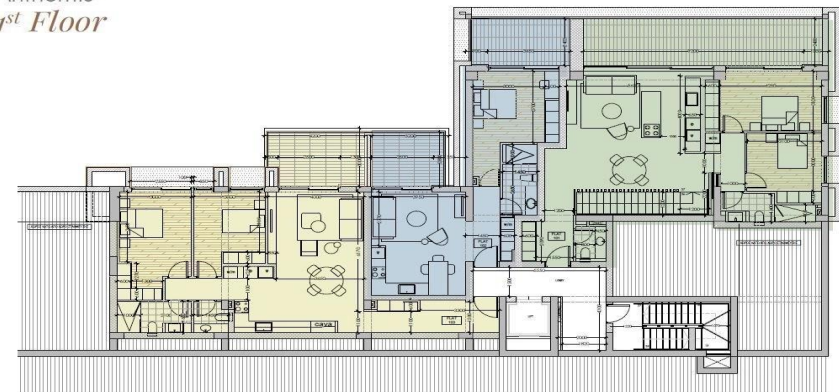
Anthemis 1 st Floor