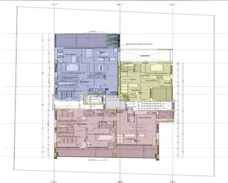
ΚΑΤΟΨΗ 1ου ΟΡΟΦΟΥ