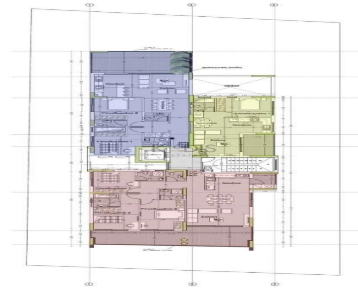
ΚΑΤΟΨΗ 2ου ΟΡΟΦΟΥ