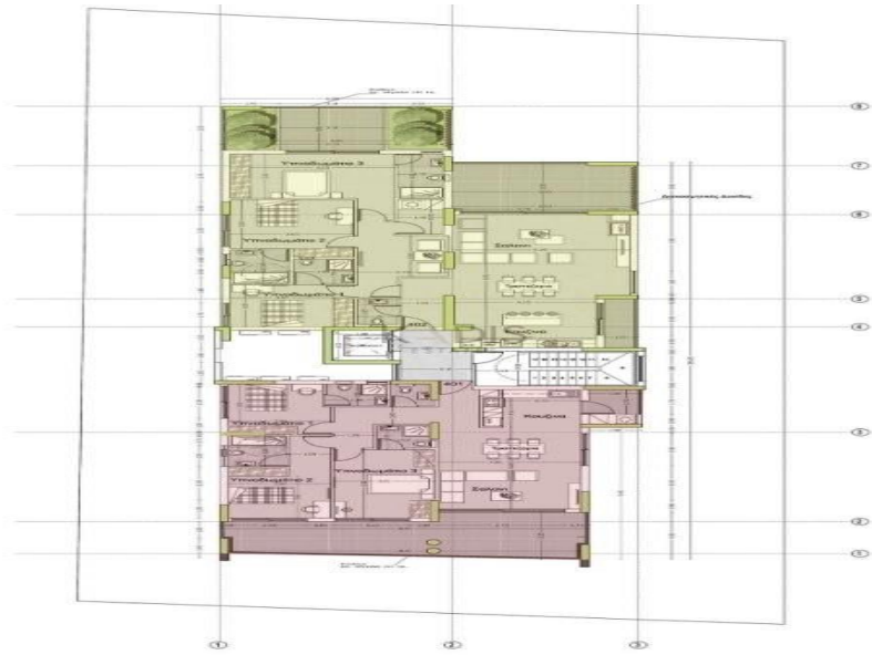
ΚΑΤΟΨΗ 4ου ΟΡΟΦΟΥ