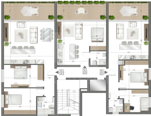
2 BEDROOMS 75 SQM + 13.25 SQM COVERED