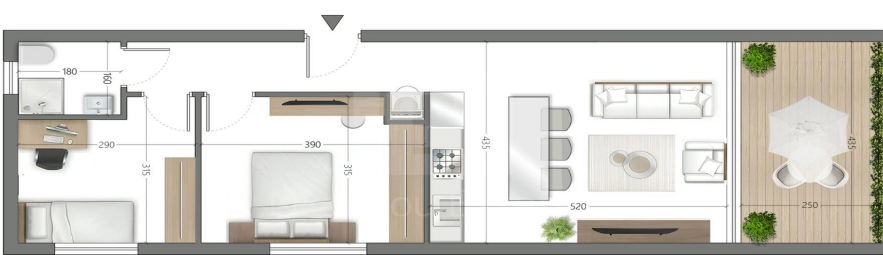
➤ N 1.5 BEDROOMS 60 SQM + 10.87 SQM COVERED