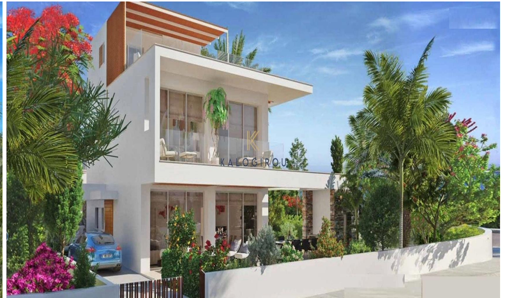
4 BEDROOM VILLA