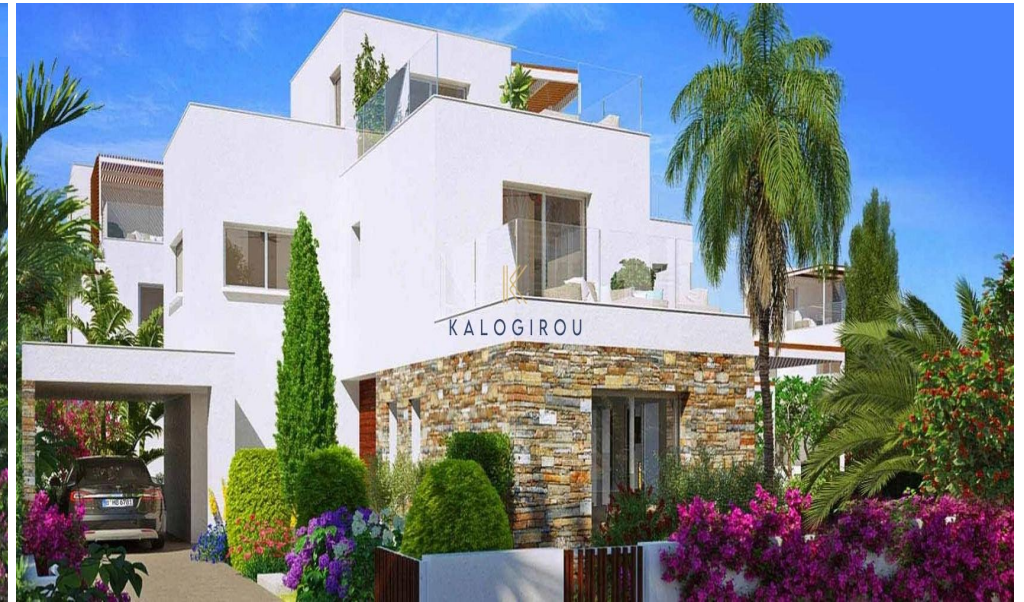
4 BEDROOM VILLA