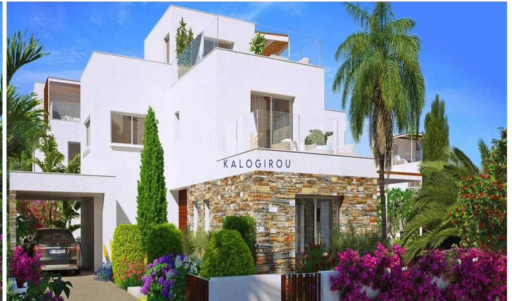
4 BEDROOM VILLA