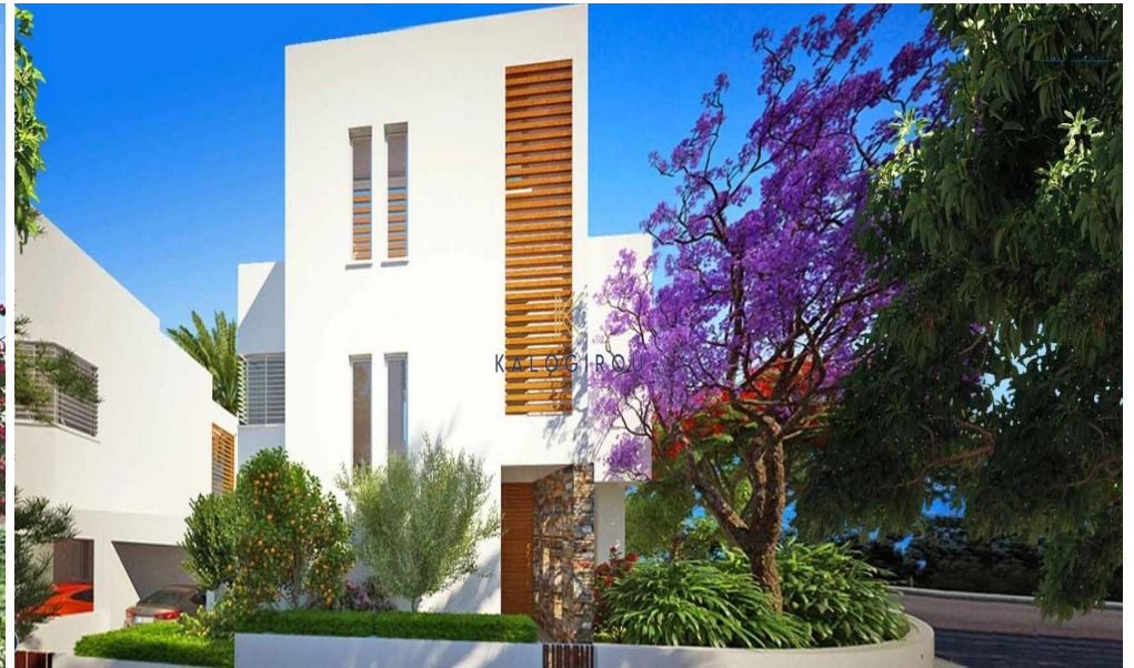
4 BEDROOM VILLA