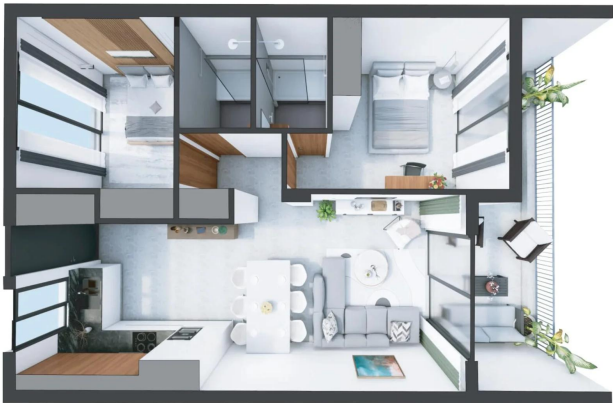
2 BEDROOM APARTMENT