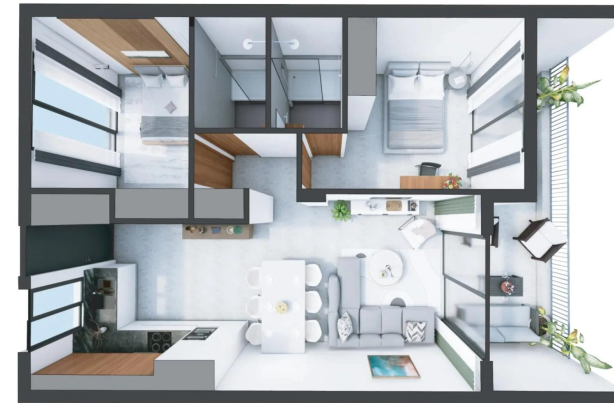
2 BEDROOM APARTMENT