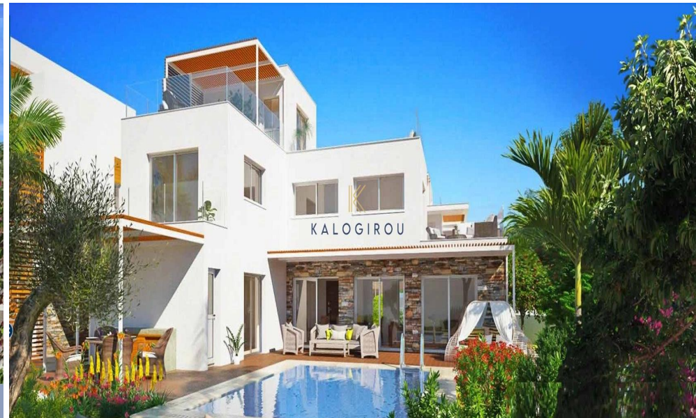
AQUAMARINE VILLAS - VILLA TYPE G