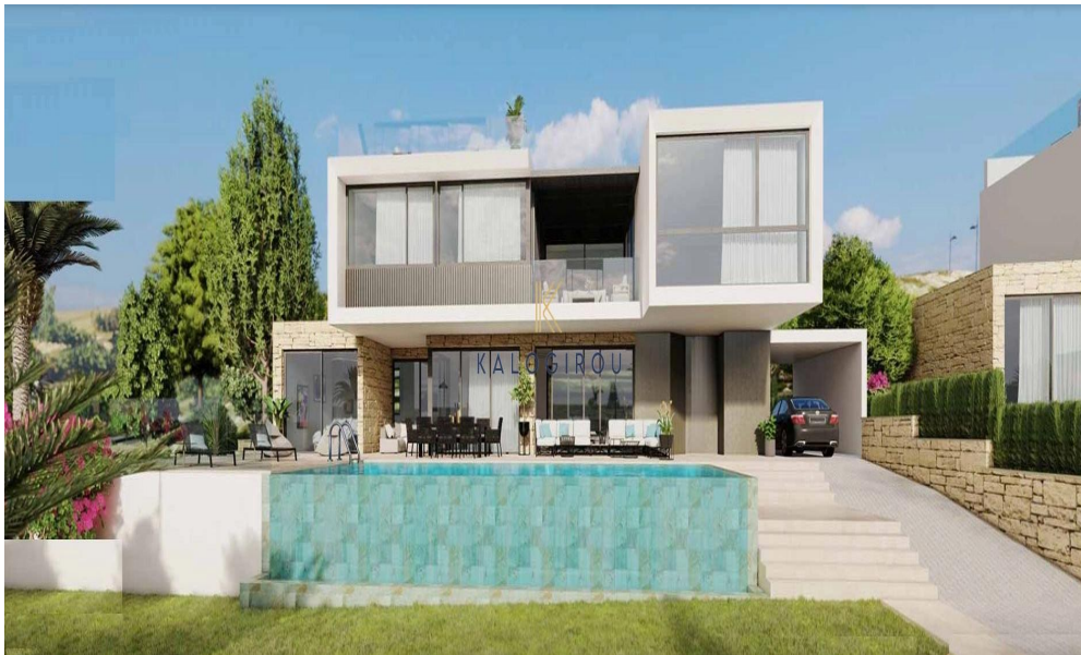
VIEWPOINT RESIDENCES / 1239 - 1 / VILLA TYPE 6A