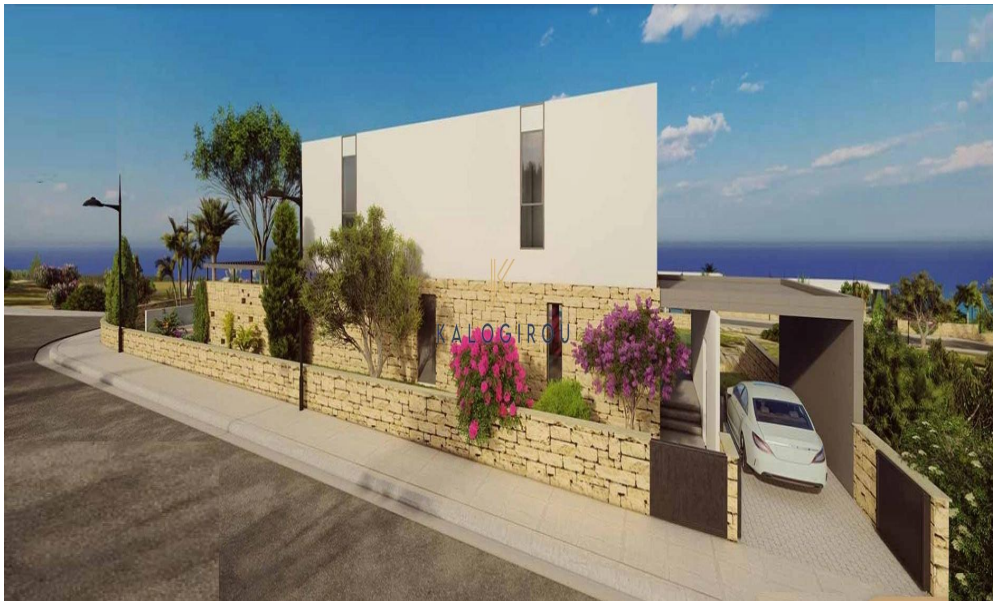
3 BEDROOM VILLA