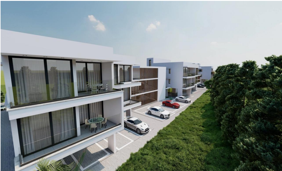
BLOCK B 1 ST FLOOR