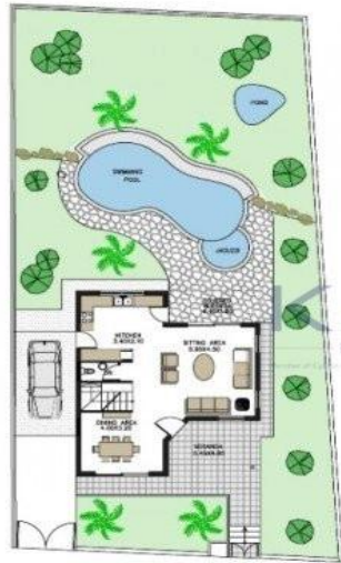
GROUND FLOOR HOUSE TYPE A