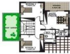
FIRST FLOOR HOUSE TYPE A