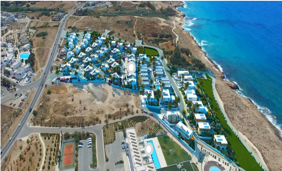
5 BEDROOM VILLA