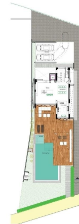
Villa 1 - Ground Floor Plan