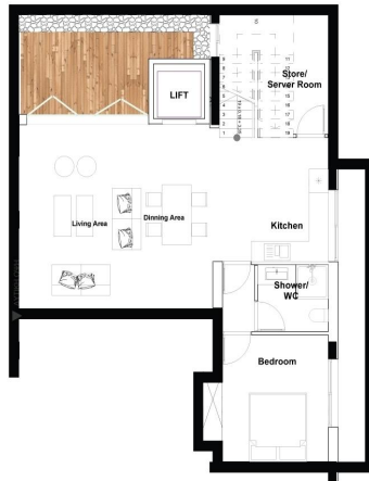
Villa 1 - Lower Level Plan