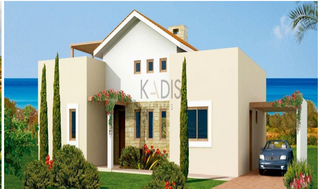
3 BEDROOM VILLA