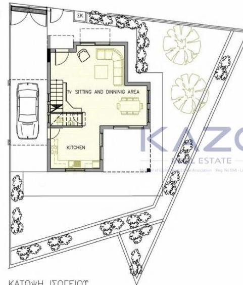
ΚΑΤΟΨΗ ΙΣΟΓΕΙΟΥ HOUSE 3