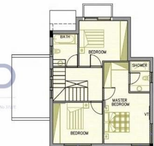
ΚΑΤΟΨΗ ΟΡΟΦΟΥ HOUSE 3