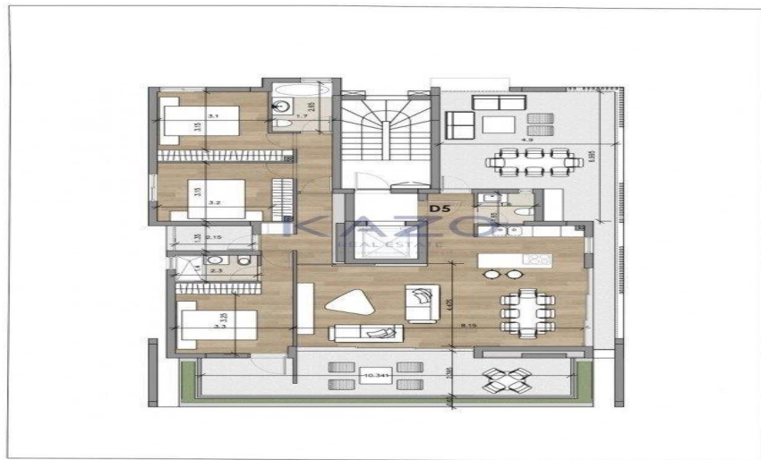
THIRD FLOOR ⊕