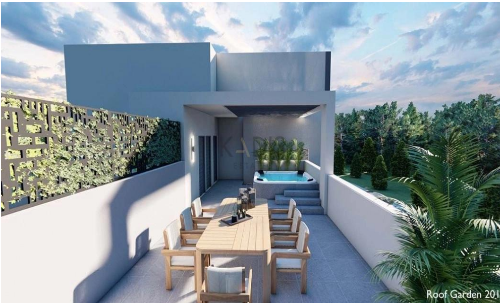
Roof Garden 201