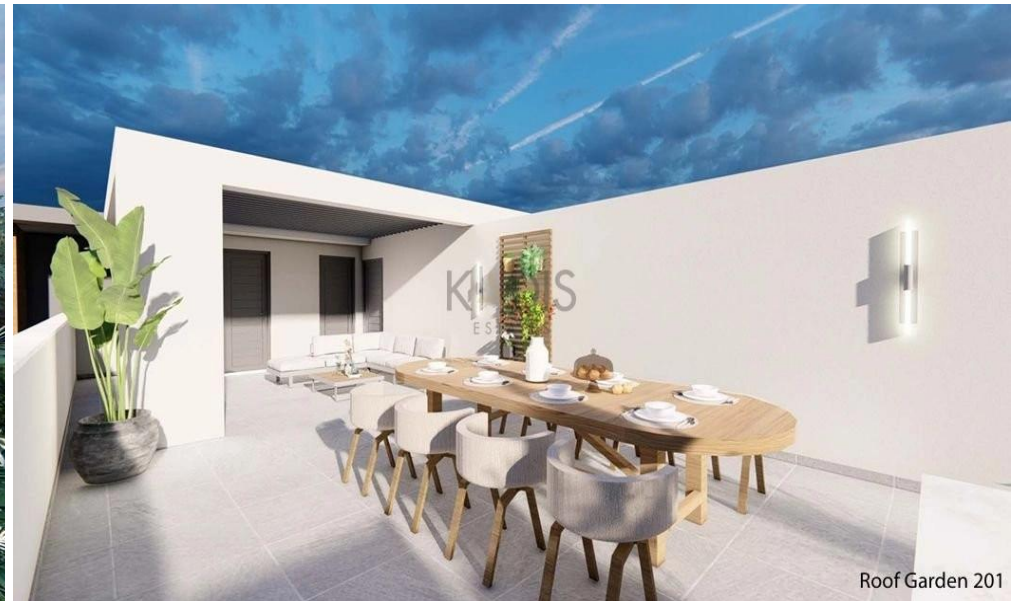
Roof Garden 201