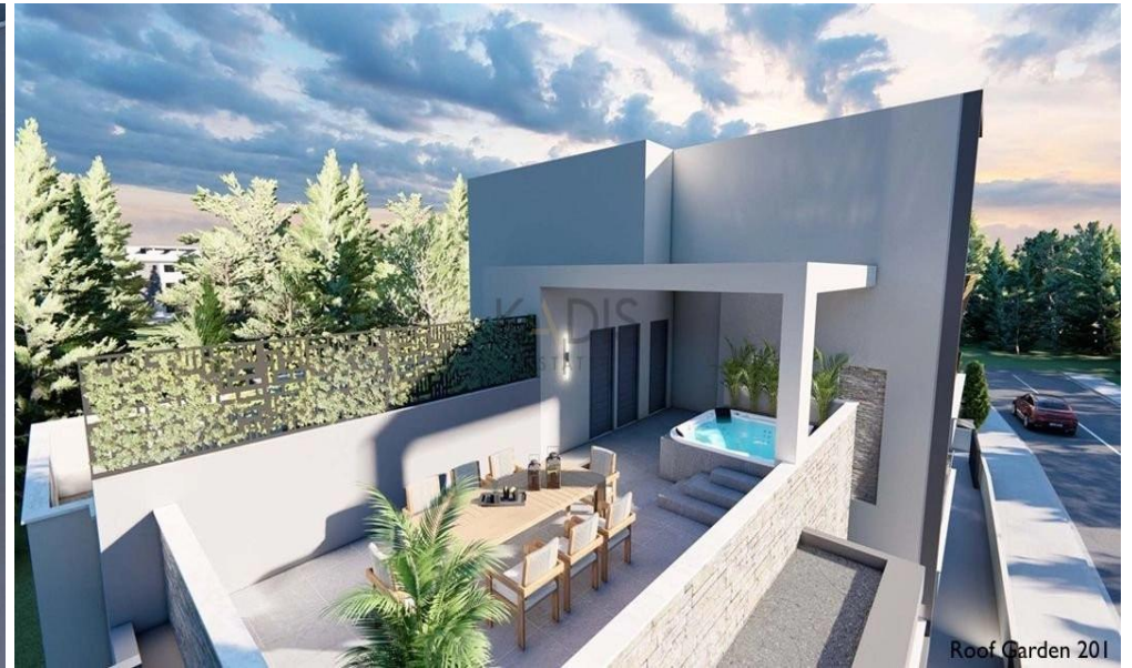
Roof Garden 201