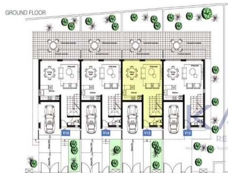
3 BEDROOM MAISONNETTE

Disclaimer: Please note that drawings shown here are for marketing purposes and should be used only as a guide. All efforts have been made to ensure their accuracy at the date of print. Please refer to architectural drawings for more accurate information on a particular property. Contact us for more information at info@oneroresidences.com . Rev. Date (Architectural Department): 11/20/20 - Rev. No (Architectural Department): 1.5