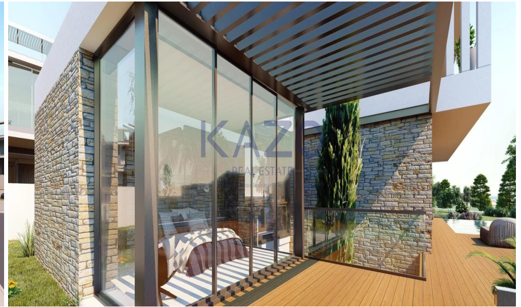
5 BEDROOM VILLA