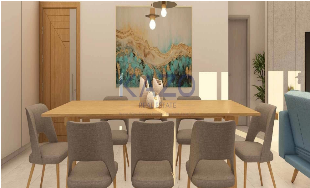
3 BEDROOM APARTMENT