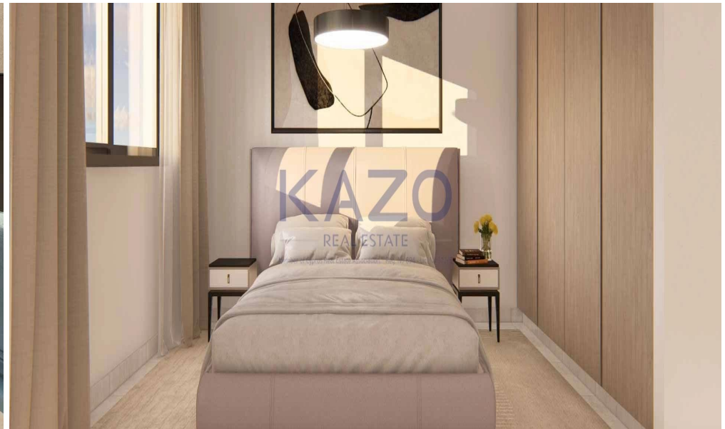
3 BEDROOM APARTMENT