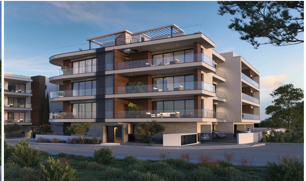
FIRST FLOOR | BLOCK A