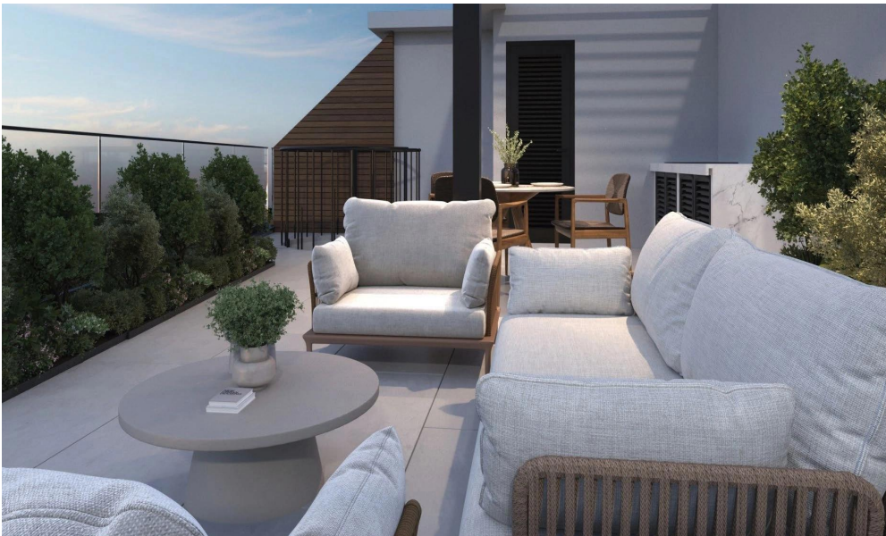
THIRD FLOOR | BLOCK B