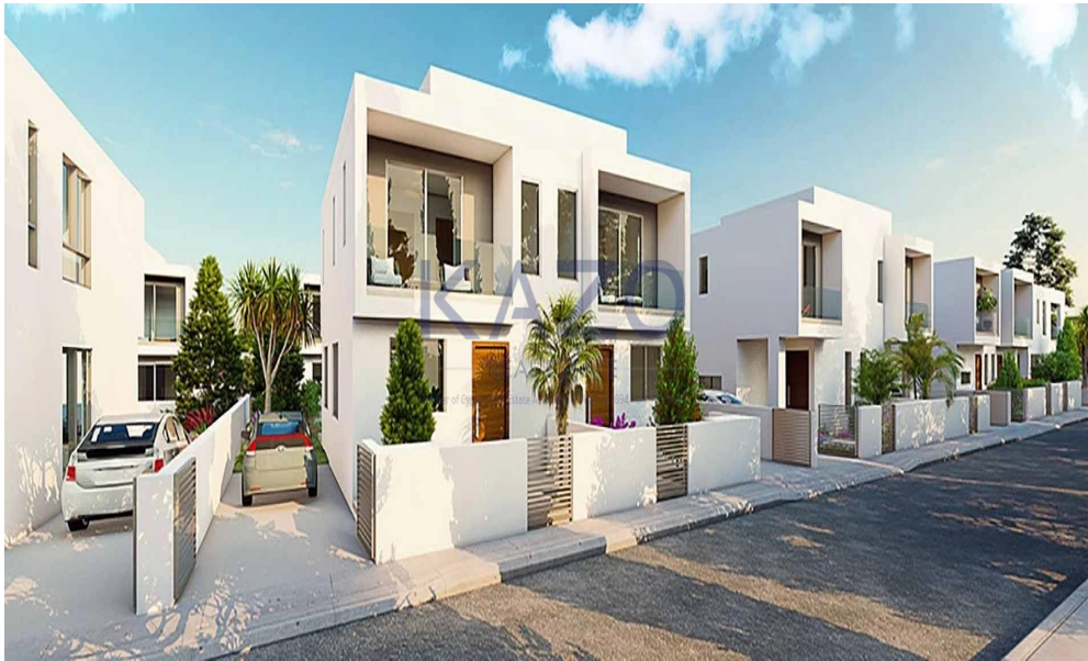
TYPE: D / 2 BEDROOMS