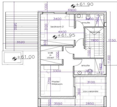
FIRST FLOOR SCALE 1:100