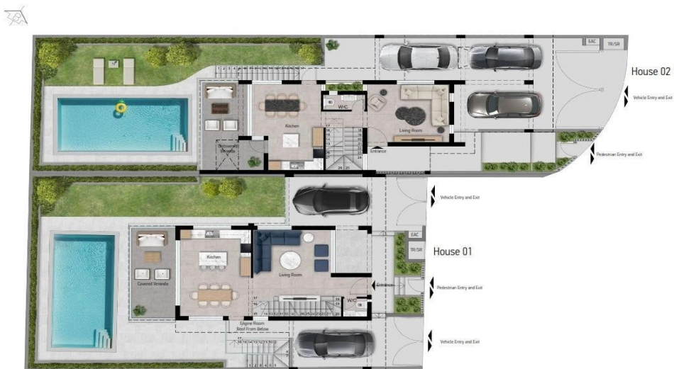
GROUND FLOOR FLOOR PLAN