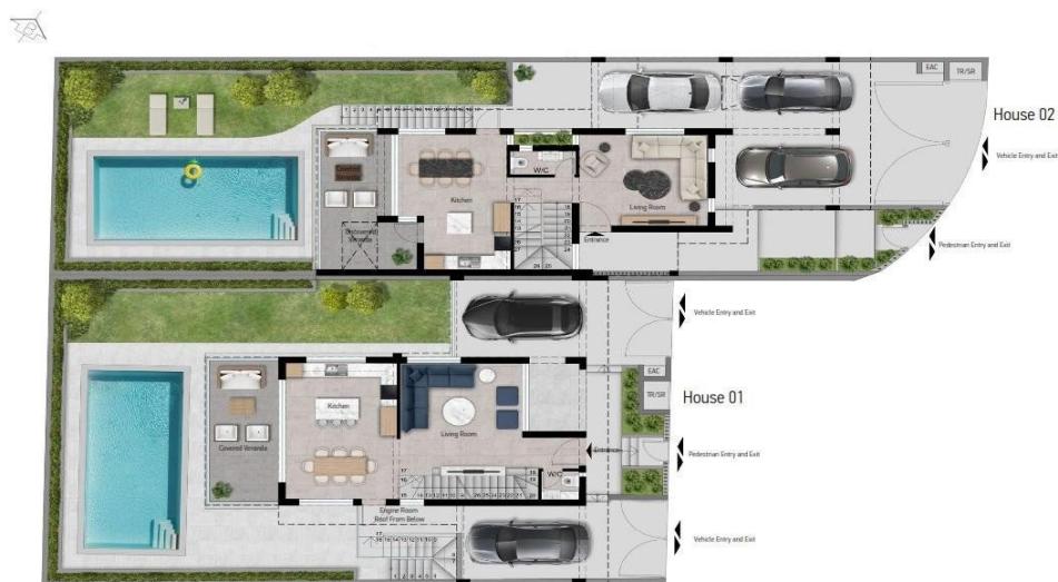
GROUND FLOOR FLOOR PLAN