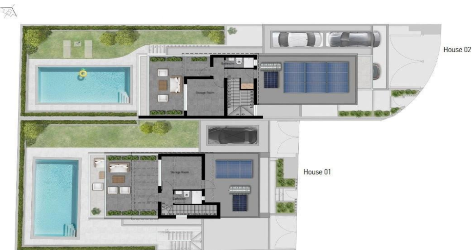
ROOF GARDEN FLOOR PLAN