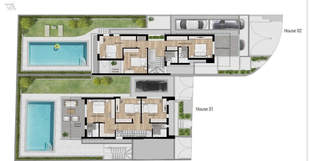
FIRST FLOOR FLOOR PLAN